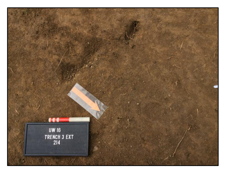
Fig A.2.10 Plan of Trench 3 extension after removal of spit 3.

Fig. A.2.9. Detail of (214). Scale is 20cm.