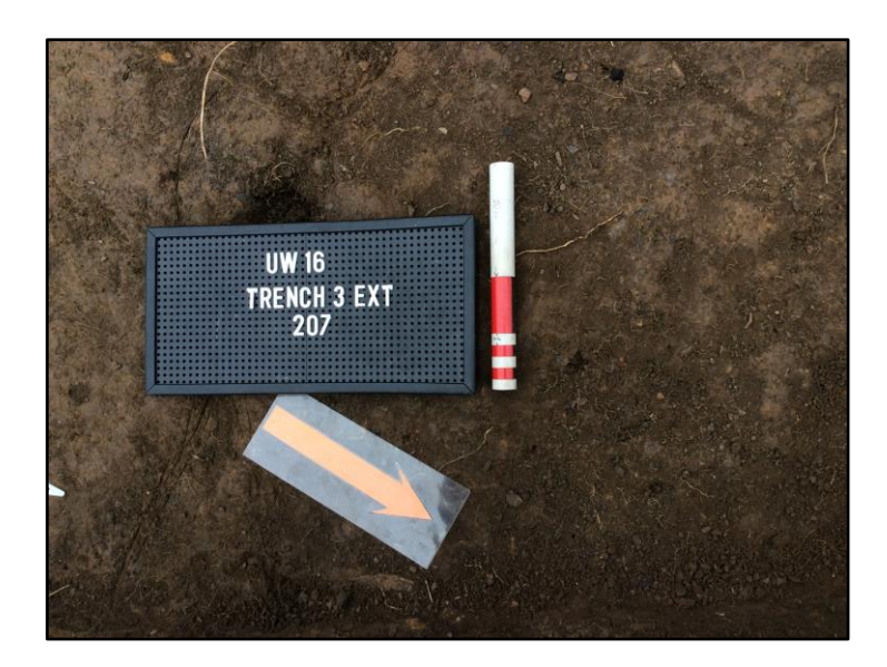
Fig. A.2.2 Detail of Context (207). Scale is 20cm.

Fig. A.2.1 Contexts (205) and (206) general view. Scale is 1 metre.