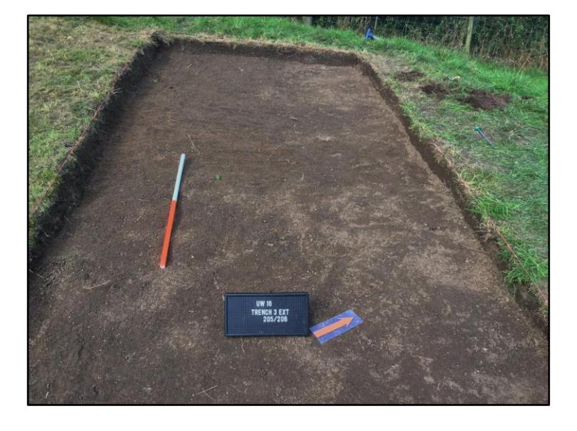
Fig. A.2.1 Contexts (205) and (206) general view. Scale is 1 metre.

Whilst (205) and (206) produced over 50 finds, (207) produced just 4. (207) was a firm/compacted silty clay containing a similar proportion of inclusions to (206) including flecks of charcoal and occasional pieces of coal.